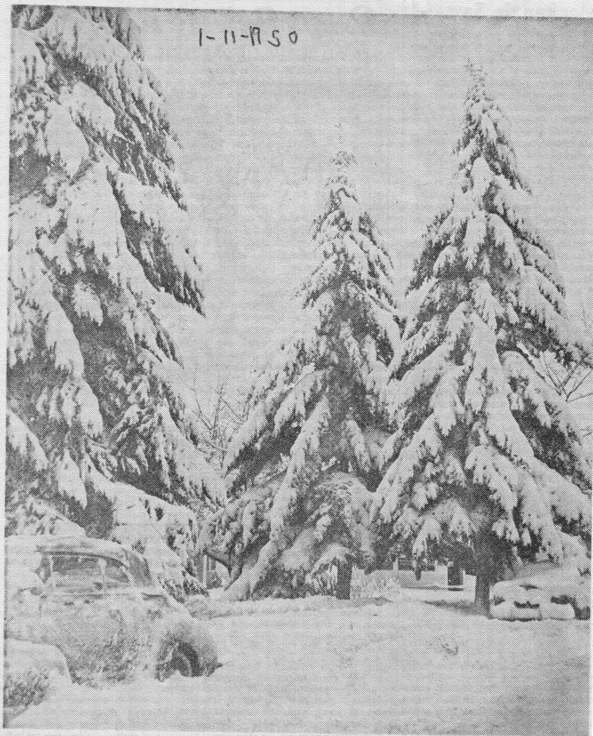
JUST LIKE MOUNT BAKER —When anywhere from six to 10 inches of wet snow fell in Bellingham Tuesday night, fir trees in the 500 block of High street, above, took on a Heather Meadows appearance Wednesday morning. Sunday night's five-inch snowfall had vanished in Tuesday's rainfall only to have the new storm nearly swamp the city.