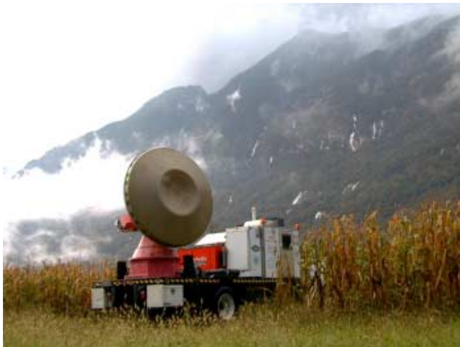
Figure 1. DOW radar truck at the Lodrino Airport site in the Ticino valley on September 26, 1999 (IOP 3).