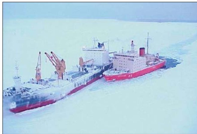
Out of a fix. A forecast model tailored to the Antarctic helped rescuers extract personnel from the supply ship Magdalena Oldendorff (left).

A third edge for mesoscale modeling—one not achieved in every forecasting operation—is the adaptation of the model to local conditions. “One-size-fits-all numerical weather prediction is not necessarily the best approach,” Mass has written. “What’s appropriate in one place,” he says, “may not be appropriate in another.” NWS’s mesoscale model Eta, for example, runs a large grid with 12-kilometer spacing that can be placed over the eastern, central, or western lower 48 states to sharpen forecasters’ views of approaching storms. Nothing about the model is changed between one region and